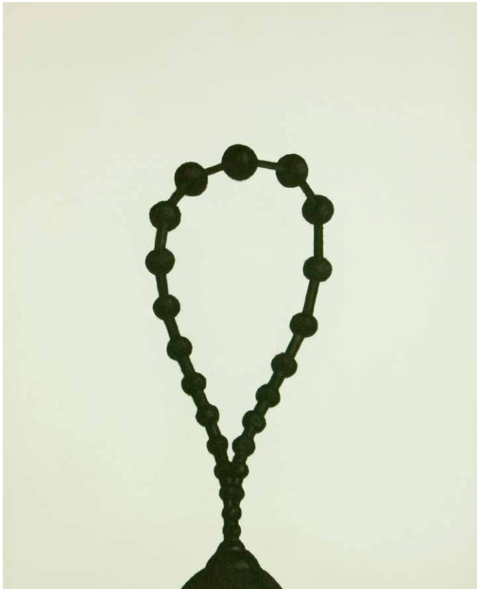
END (BEIJING), 2013

First Class Mail US Postage Paid Berkeley, CA Permit #559