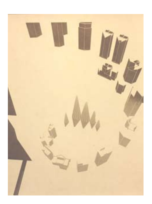
Beyond the Great Eclipse: Impossible Perspective Shadow Form Three, 2009

Direct to plate aquatint with chine collé gampi; Paper size: 25" x 17.5"; Edition of 20