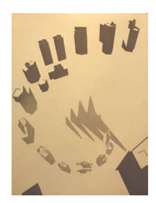
Beyond the Great Eclipse: Impossible Perspective Shadow Form One, 2009

First Class Mail U.S. Postage Paid San Leandro, CA Permit #85