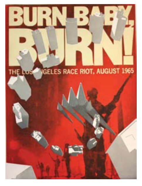
Beyond the Great Eclipse: Burn Baby Burn, 2009

Direct to plate photogravure and aquatint; Paper size: 25" x 17.5"; Edition of 20