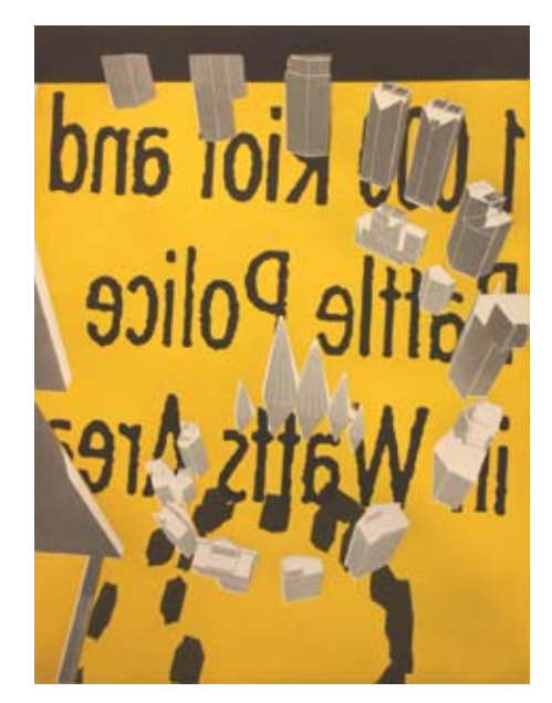
Beyond the Great Eclipse: 1000 Riot, 2009

Direct to plate photogravure and aquatint; Paper size: 25" x 17.5"; Edition of 20