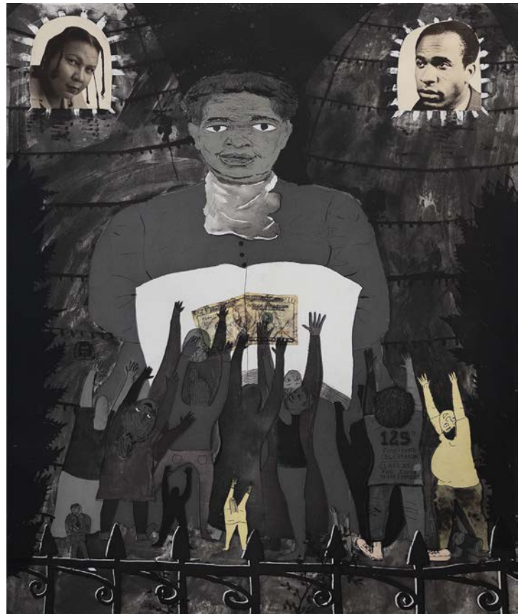
Greg Rick Which Side Are You On?, 2024 Color aquatint, sugarlift and spitbite aquatints with chine collé Edition of 15 Paper Size: 49" x 41.5" Image Size: 43" x 36"