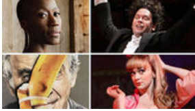
CHEAT SHEET: Spring Arts Preview