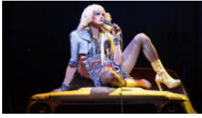
PHOTOS: Hollywood stars on stage