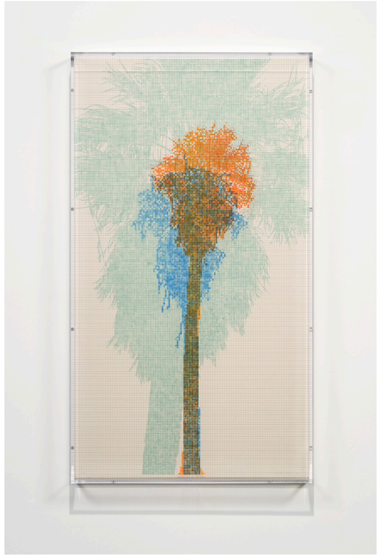
Numbers and Trees: Palm Canyon, Palm Series 4, Tree #2, Kitanemuk, 2021 Color aquatint, spitbite aquatint and chine collé with printed acrylic box. Image Size: 62" x 35" x 3.5" Edition of 35