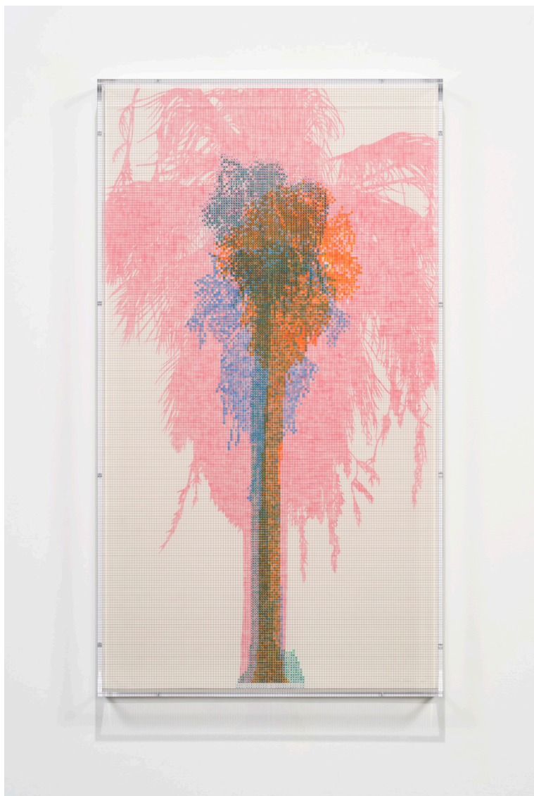
Numbers and Trees: Palm Canyon, Palm Series 4, Tree #3, Chumash, 2021 Color aquatint, spitbite aquatint and chine collé with printed acrylic box. Image Size: 62" x 35" x 3.5" Edition of 35