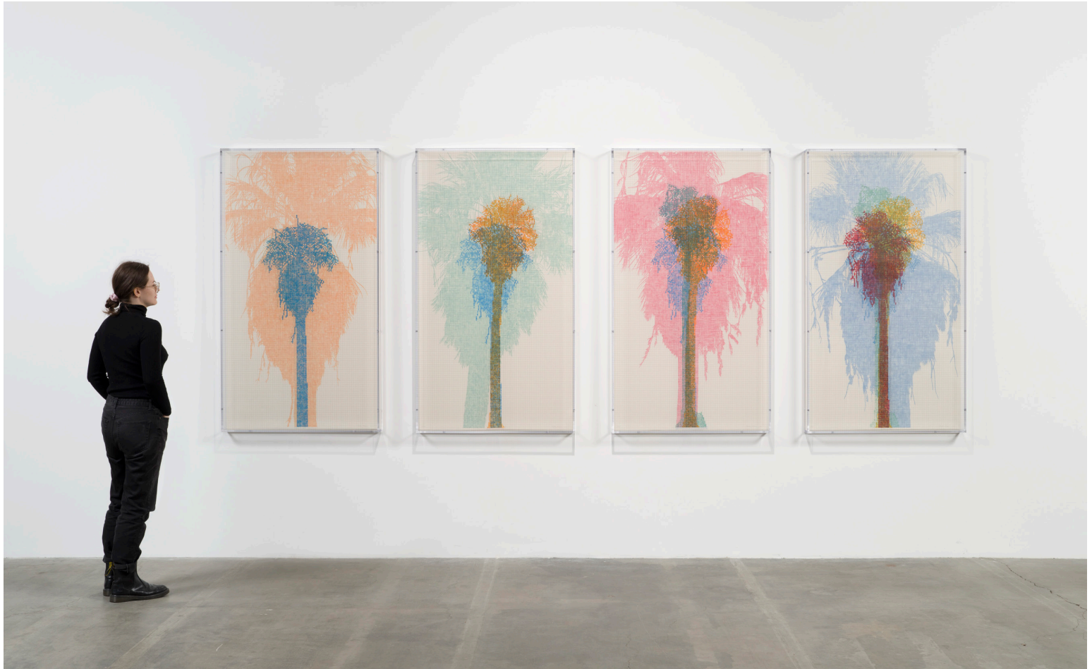
Numbers and Trees: Palm Canyon, Palm Trees Series 4, Tree #1-#4, 2021 Color aquatint, spitbite aquatint and chine collé with printed acrylic box. Image Size: 62" x 35" x 3.5" each Edition of 35

© Charles Gaines Courtesy the artist and Hauser & Wirth Photo: Fredrik Nilsen