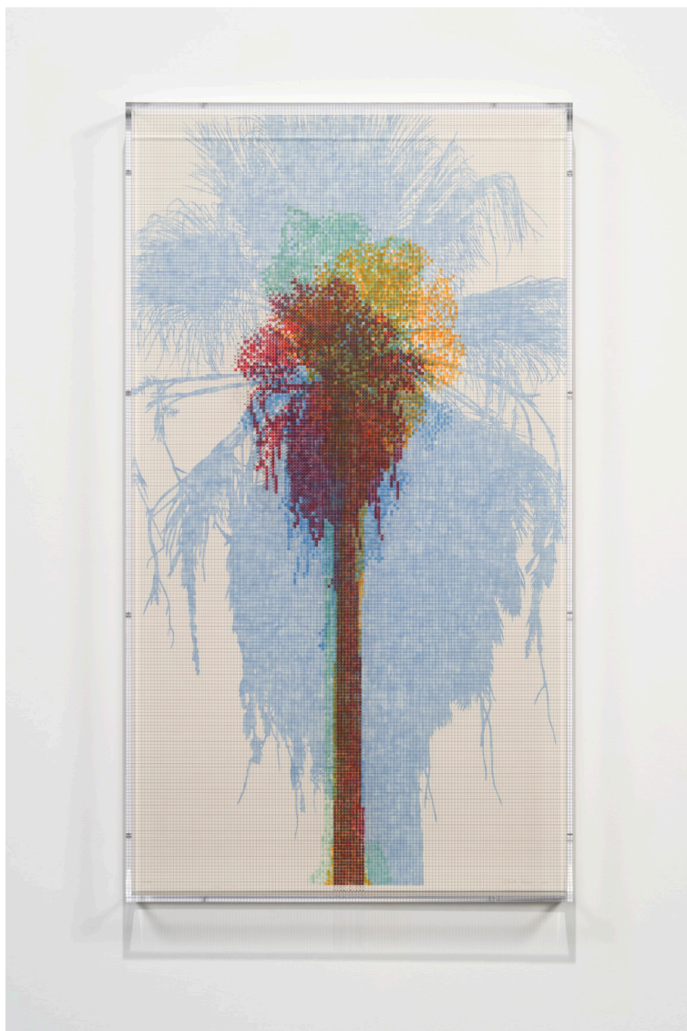
Numbers and Trees: Palm Canyon, Palm Series 4, Tree #4, Acjachemen, 2021 Color aquatint, spitbite aquatint and chine collé with printed acrylic box. Image Size: 62" x 35" x 3.5" Edition of 35