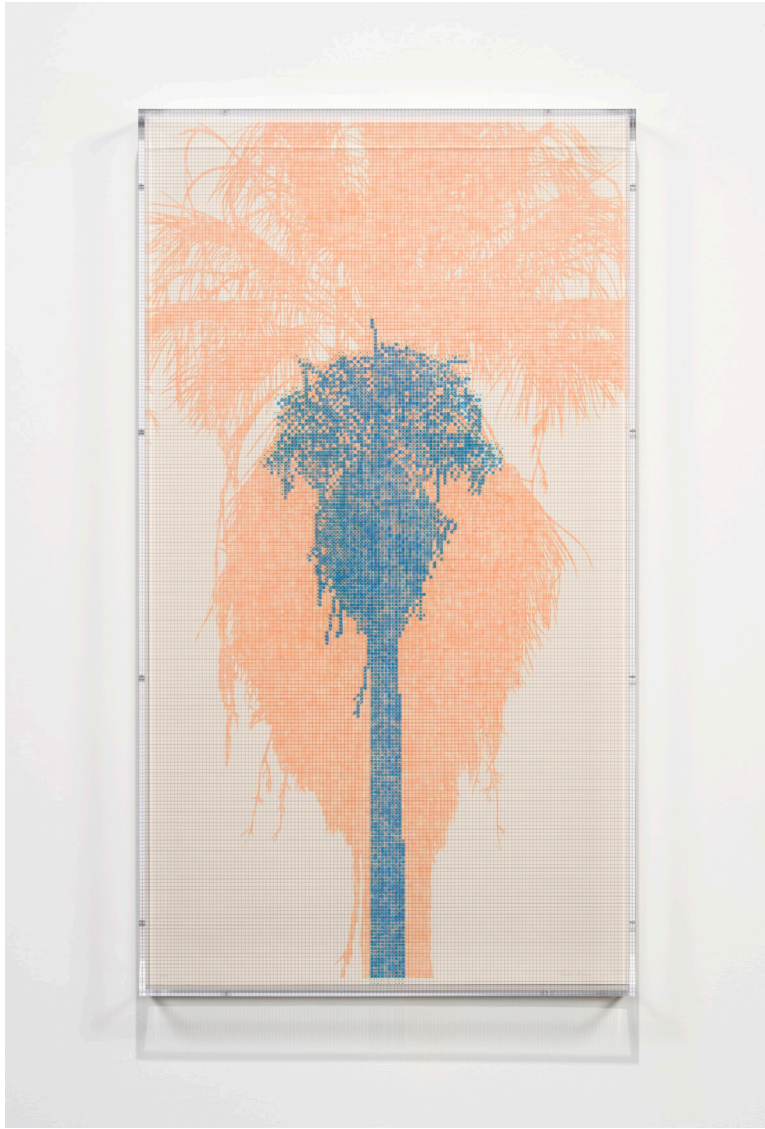
Numbers and Trees: Palm Canyon, Palm Series 4, Tree #1, Tataviam, 2021 Color aquatint, spitbite aquatint and chine collé with printed acrylic box. Image Size: 62" x 35" x 3.5" Edition of 35